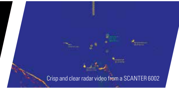
Crisp and clear radar video from a SCANTER 6002