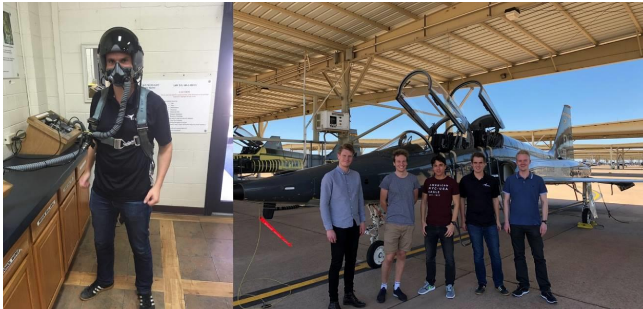
Figure 8: Visiting Sheppard AFB, where the Danish fighter pilots are trained in the ENJPT program

simulators, which has been an amazing experience! In the evening, a pilot class had its drop night, which is when the pilots get to know, which aircraft they have been selected to fly after finishing initial pilot training.