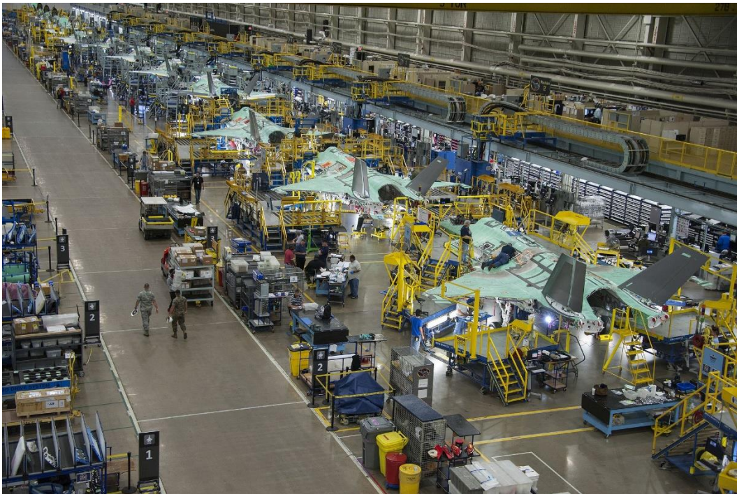
Figure 3: F-35 final assembly in Air Force Plant 4

The United States Air Force Plant 4 was built in 1941 and originally used to produce the B-24 Liberator. In recent years, the plant has been used for the production of F-16 (originally produced by General Dynamics) as well as for components of F-22. The plant is now entirely focused on the production of the F-35 as the last parts of the F-16 production line have been moved to Greenville, South Carolina in the end of 2017.