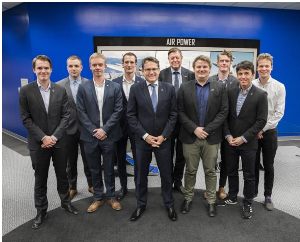
Figure 6: Danish Minister for Industry Brian Mikkelsen with the Terma intern group

The Danish Minister for Industry, Business and Financial Affairs, Brian Mikkelsen, also visited the facility during our time interning at Lockheed Martin. The intern group met with him and his delegation, where we shared our experiences and impressions about the workplaces and the F-35 program in general.