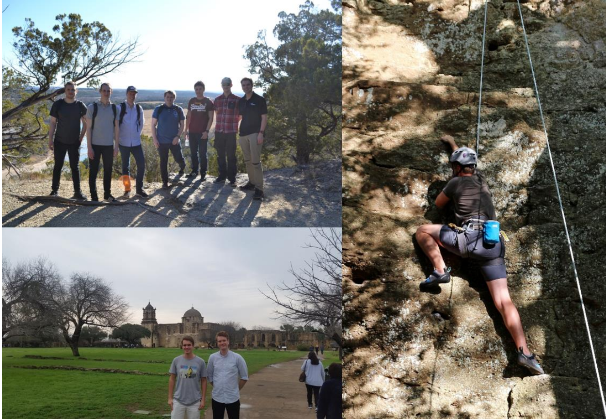
Figure 10: Clockwise from top left: Hiking in Dinosaur Valley State Park, Climbing in Mineral Wells State Park, Visiting the Missions in San Antonio

Also, I took advantage of being in Fort Worth, a city that has a lot of activities to offer. I have had the chance to attend a couple of Rodeos, which has always been a very fun experience. In the Stockyards, I have also visited some other iconic places, such as Billy Bob's, Joe T Garcias, White Elephant Saloon and Cattlemen's. We also took the opportunity to see a NASCAR race at the Texas Motor Speedway (it was very loud).