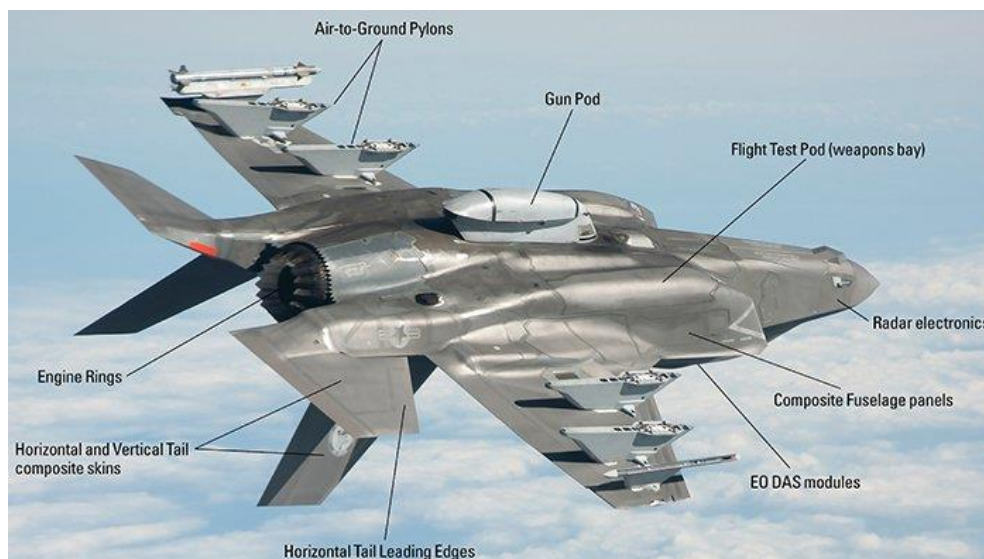
Figure 4: Components on the F-35 manufactured by Terma

Danish industry has also contributed and drawn benefit from the F-35 program. Terma, has been awarded several contracts by Lockheed Martin, BAE systems and Northrop Grumman Corporation for the production of composite and machined parts 3 . An overview of the main components manufactured by Terma can be seen in Figure 4.