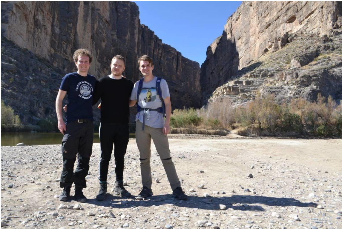
Figure 7: Hiking in Big Bend National Park

After having completed the necessary formalities and getting settled at work, we took our first long weekend (employees at Lockheed Martin get every second Friday off) trip to Big Bend National Park. The park is huge and offers a lot of different landscapes. We managed to combine sightseeing from the car and two hikes.