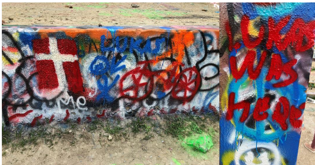
Figure 9: Graffiti Park in Austin

Texas is just huge, there are lots of great travel destinations nearby. Some of the other trips we have taken have been to Austin, Dallas, Fredericksburg, San Antonio and to Houston, where we got an extensive tour of the Johnson Space Center (level 9 tour), which has just been amazing! There are also a lot of nice natural parks nearby. One of the other interns and I took advantage of the amazing conditions for rock climbing at Milton Reimers Ranch Park near Austin, we have also been climbing out at Mineral Wells State Park a couple of times. We have also been to Dinosaur Valley State Park, where there are dinosaur tracks in the rocks.