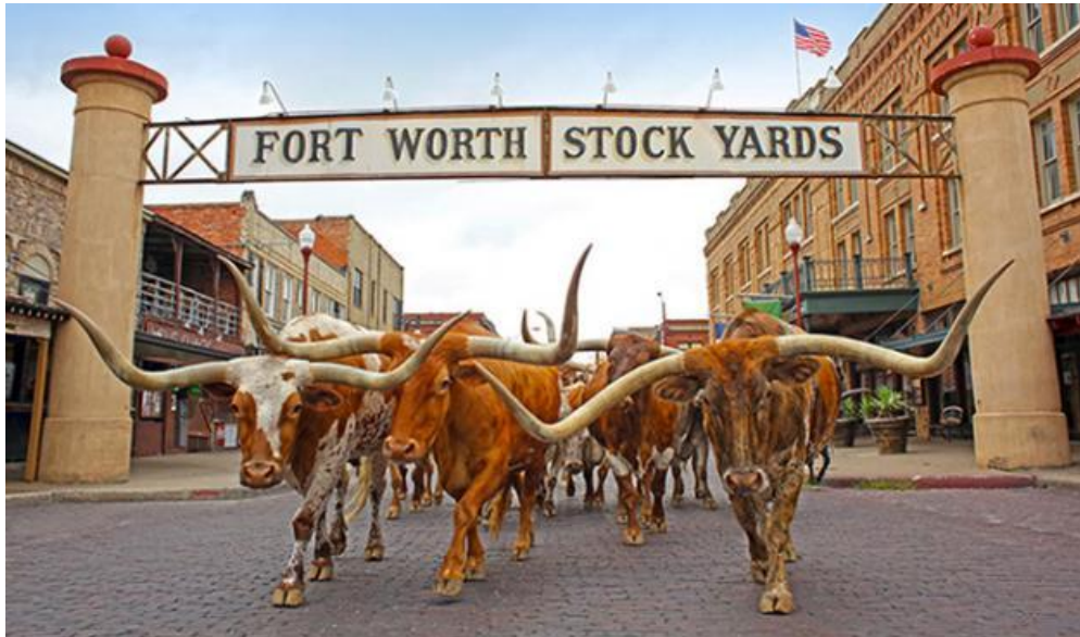
Figure 2: Cattle Drive in the Fort Worth Stockyards ( http://www.fortworthstockyards.org/play/fort-worth-herd-cattle-drive )

Besides of the Stockyards, Fort Worth is a very clean city with a very large amount of bars and restaurants. Apart from Lockheed Martin, a lot of large global companies, such as Bell Helicopters, American Airlines, AT&T and Exxon Mobil are present in the Dallas – Fort Worth area, which consequently has a strong local economy.