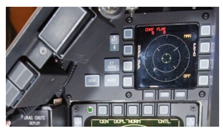
ATD in F-16

AH-64D Apache F-16 CH-47D&F Chinook P-8A C-160 Transall Mi-17/Mi-24 AS532 Cougar Falcon 2000 C-295 Joint Cargo Aircraft Archangel NH-90 C-130H/J Bombardier Challenger 650