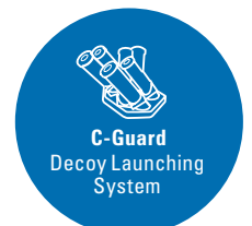
C-Guard Decoy Launching System

C-Guard relies on combat proven 130 mm NATO decoys and a proven mechanical launcher design without moving parts, guaranteeing high availability and lowest total cost of ownership.