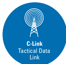
C-Link Tactical Data Link

C-Link offers Link 11, Link 16, Link 22 (optional) or Link T (proprietary Terma Data Link System) in accordance with customer requirements. Solutions are scaled to fit any maritime, land, or airborne platforms.