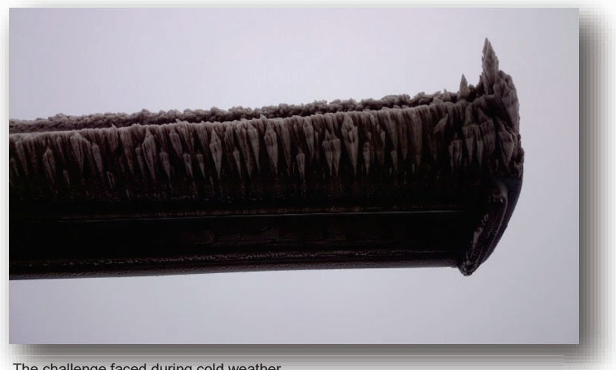
The challenge faced during cold weather

The Anti-Icing antenna is a stand-alone system, independent of the Surface Movement Radar manufacturer.