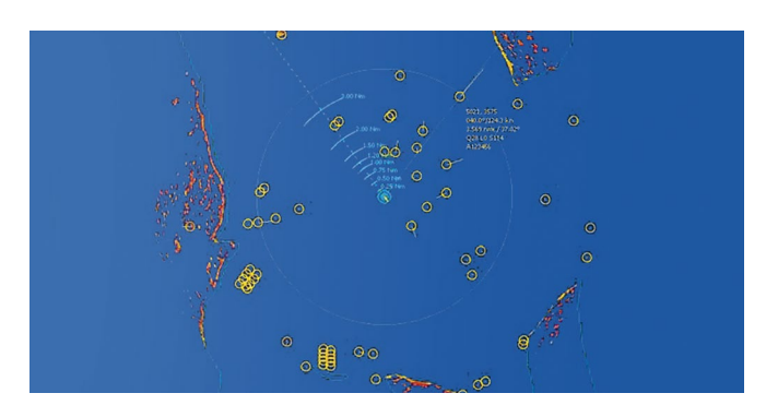
Crisp and clear radar video from SCANTER 4603

Terma has more than 60 years of Surveillance & Mission Systems experience and more than 3,000 radar systems in service worldwide. Navies, Coast Guards, and other high-demanding authorities around the world rely on our high resolution surveillance capabilities for securing the maritime domain and the sea lines of communication.