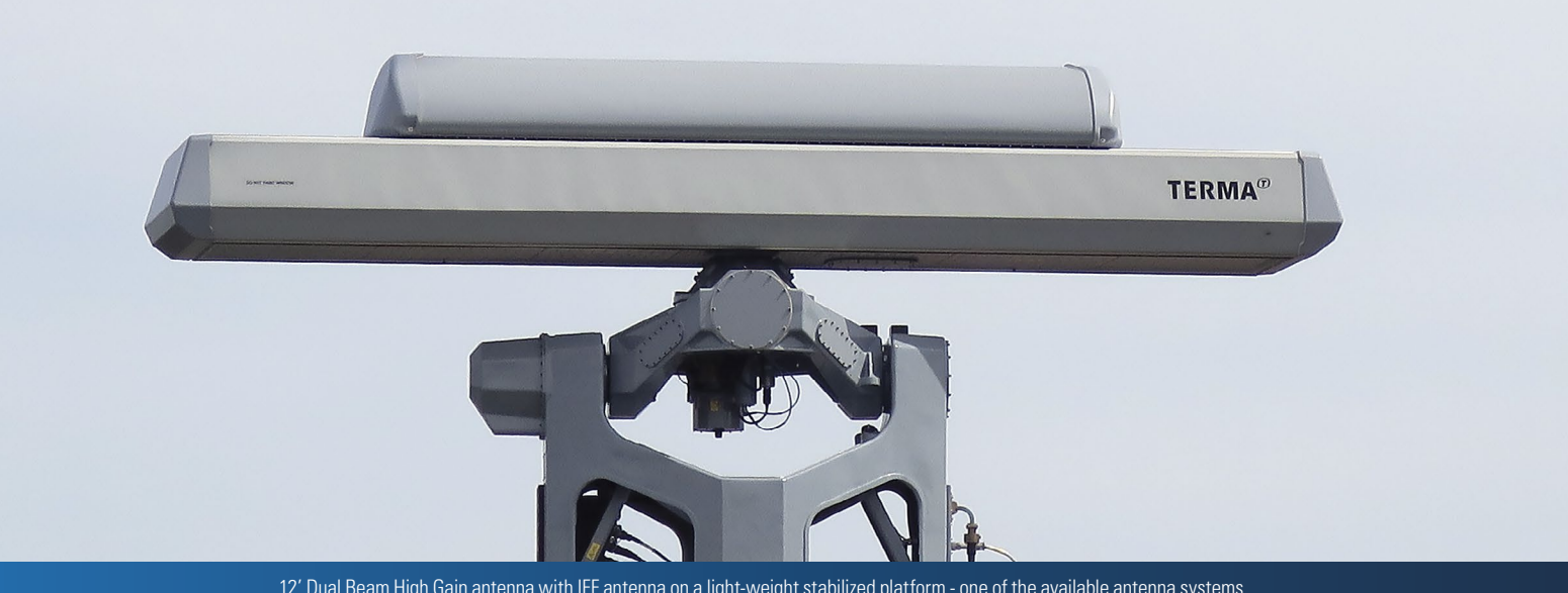
12' Dual Beam High Gain antenna with IFF antenna on a light-weight stabilized platform - one of the available antenna systems